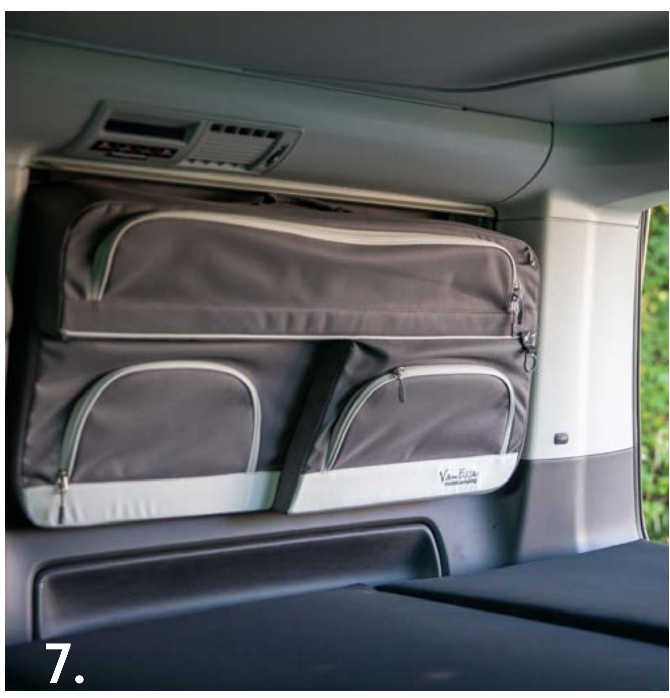
Then push the 2 seater bench back into the desired position (pic. 4 - 7).